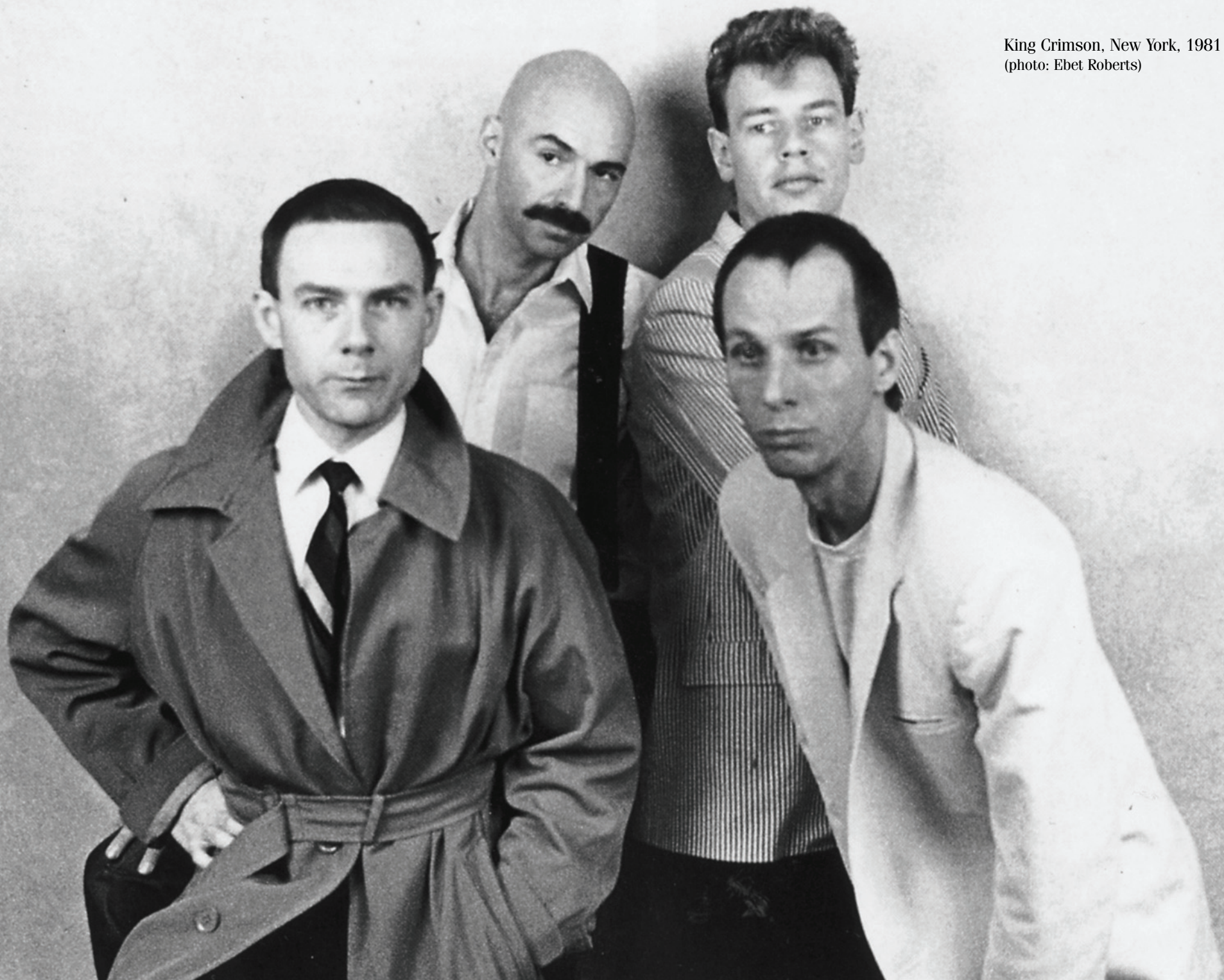
King Crimson, New York, 1981